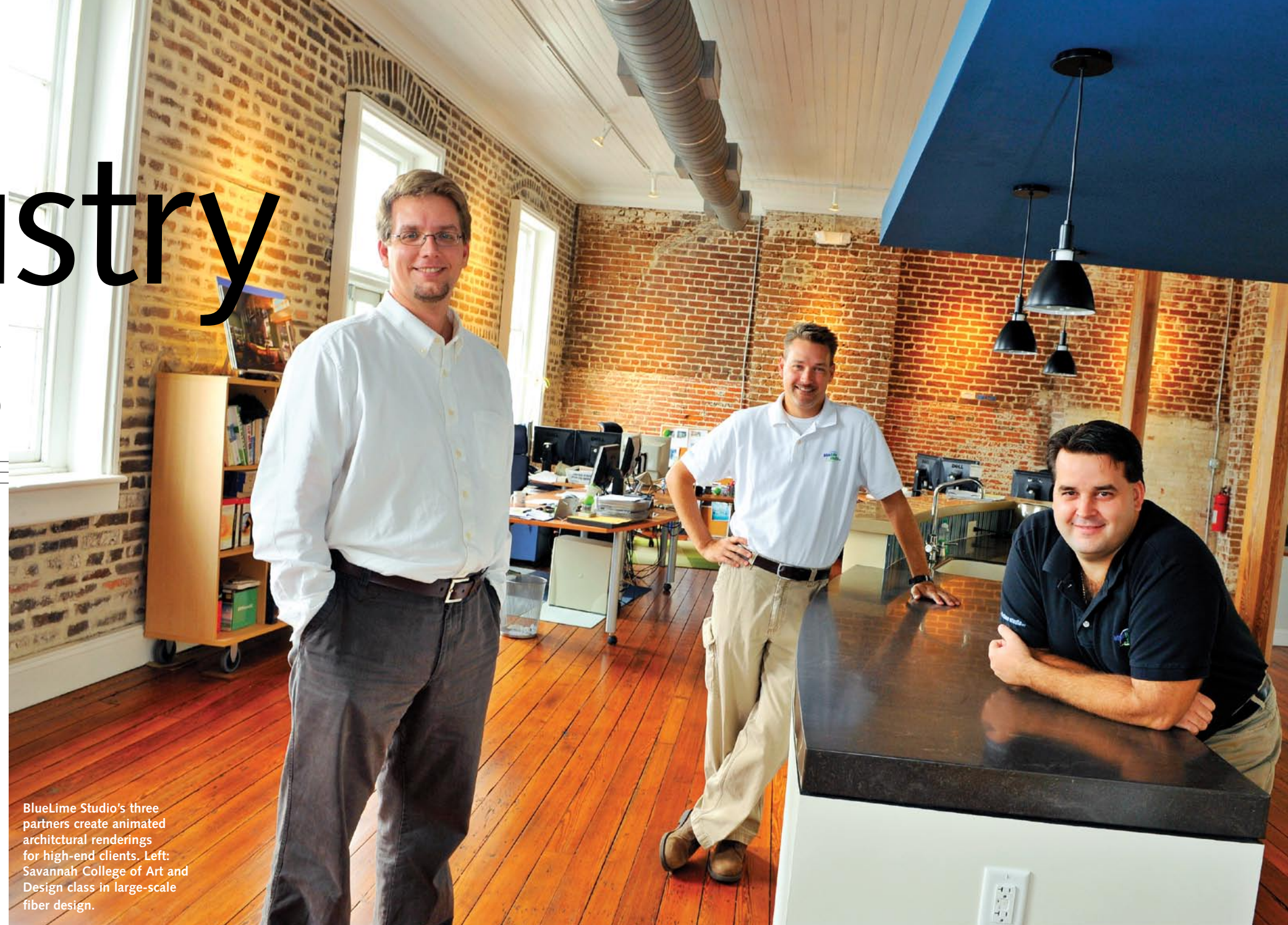
BlueLime Studio's three partners create animated architectural renderings for high-end clients. Left: Savannah College of Art and Design class in large-scale fiber design.